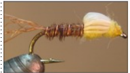
Deer hair version

When fishing this pattern, you will want to avoid using an indicator or a dry fly when fishing this pattern as it will cause both patterns to have an unnatural drift. It is best to just use the nymph by itself and watching your line/leader connection for unusual movement - something similar to the technique that is used in High Sticking or European Nymphing. Remember, when fishing to the hatch, there is always more activity below the surface than what seen above, and this fly will be a total advantage in this situation. Until next month tight lines and snazzy flies.