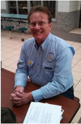
At Large & In Charge