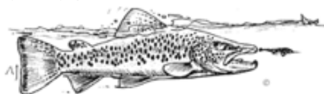
Youth School - May 7, 2016

If you would like to volunteer to help with the Banquet in any manner, big or small, contact me at: flyfishray@comcast.net.