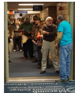
Waiting for the show to begin.