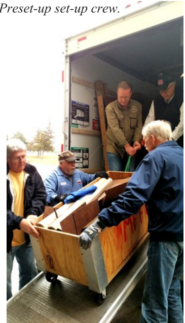
Preset-up set-up crew.