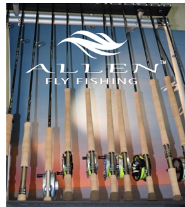
Allen Fly Fishing Welcome to the purveyor of our new Expo Club performance shirts & all things fly fishing.