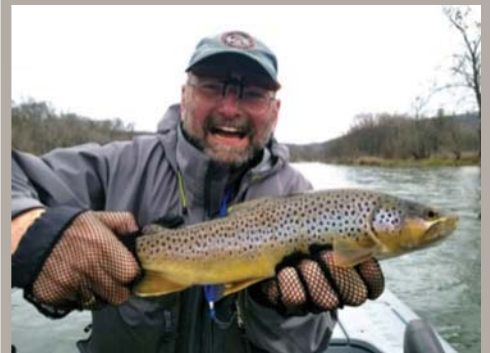
Hold it out, it will look bigger!