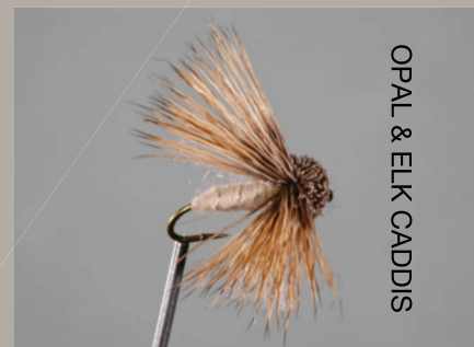
OPAL & ELK CADDIS