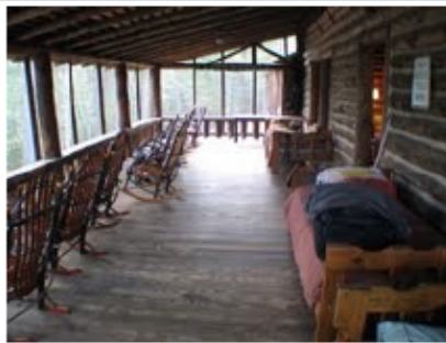
The always existing porch at WaWaSum.

The “Bless the Waters with Rod & Fly Outing” is intended for experienced anglers who worship fishing along the AuSable River system and are eager to present their terrestrials, nymphs and late-season dries to the fish gods in