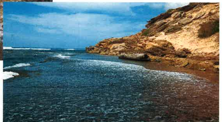
Fin's Office Surf fishing site in South Poipu, Kauai