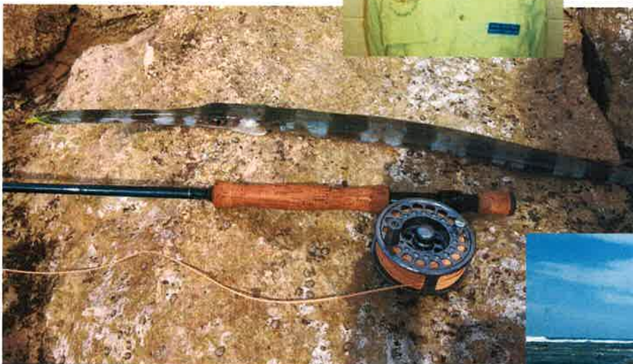
Kauai Needle Fish