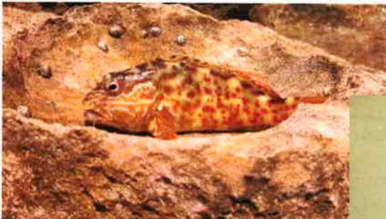
Fins Official Hawk Fish