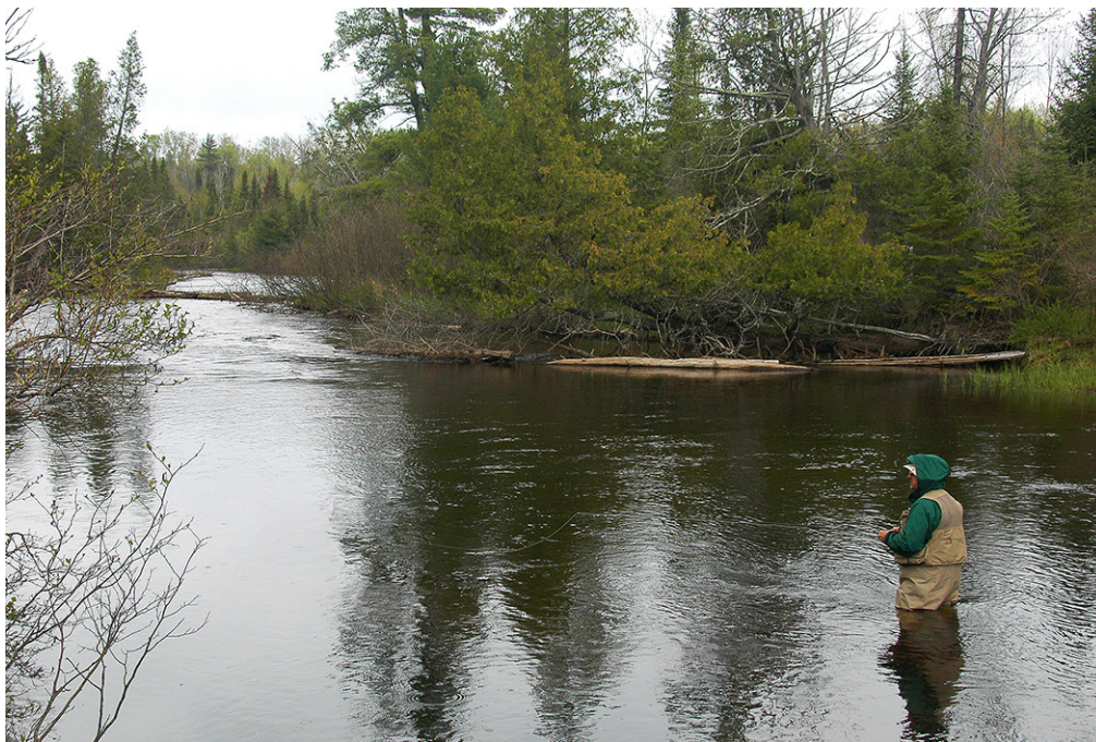
What binds us all together; A fly fisher searches for trout during a cold, rainy morning on the South Branch of the Au Sable River.

We did suffer financially when the Expos were canceled and we had to rely solely on membership dues to fund