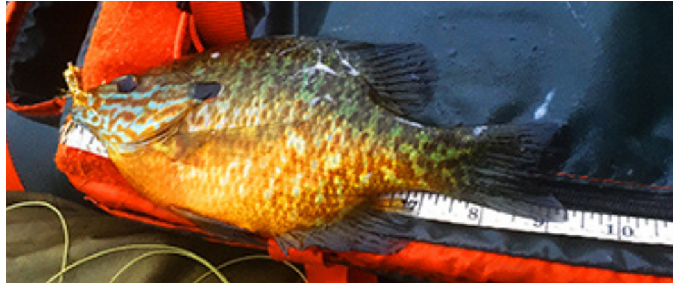
Trying to catch that elusive 9-inch pumpkinseed? Todd Schotts' panfish flies can help in that quest.

With the tag at the end of the fly (remember not to trim off the tag end) fold it over and wrap it down.