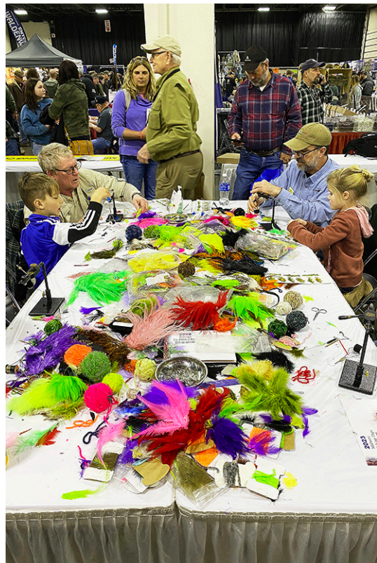
Above left: MFFC members gave up a Saturday morning teaching children how to tie flies at Outdoorama. Above right: A table full of feathers chenille and thread for wooly buggers at Outdoorama.