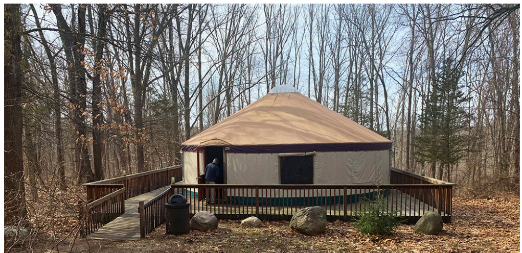
The riverside Yurt at the Walled Lake Outdoor Education Center.

MFFC will be on hand to provide coffee, soft drinks, donuts and tips on how to catch a trout at the Walled Lake Outdoor Education Center Yurt adjacent to the Huron River. A valid 2023 All-Species Michigan fishing license is required to fish.