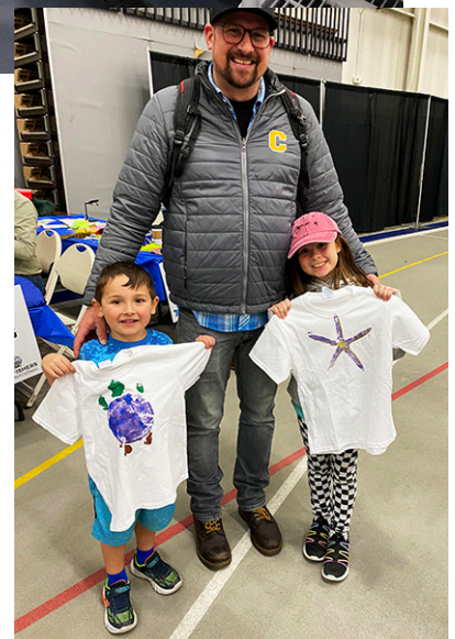
Not all fine art at the Expo was created by adults.