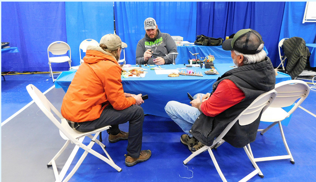
A pair of fly anglers learn a new fly recipe at the 2023 Midwest Fly Fishing Expo.