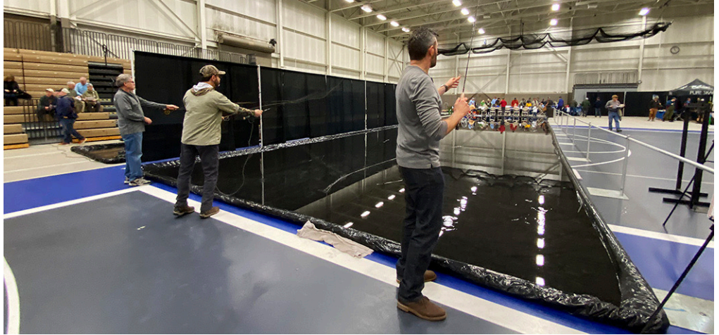
Anglers work on their skills at the Midwest Fly Fishing Expo casting pond. MFFC members can do the same with an instructor at MFFC Member School on April 22.

The event will be held rain or shine, and casting will be outside, so please make sure you have appropriate clothing. Because the Scout School will be using the Club rods, you will need to bring your own rod for casting.