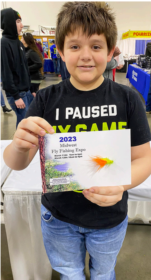
Below right: He couldn't be more pleased with himself at Outdoorama. Maybe someday he'll join MFFC.