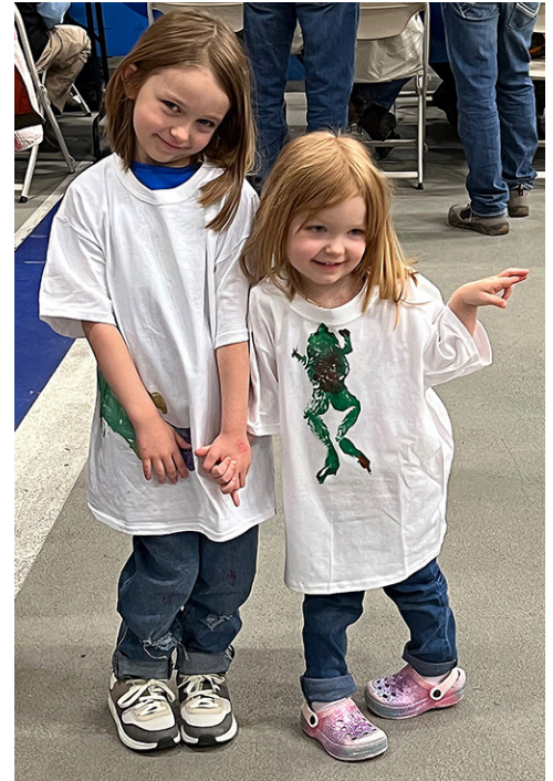
Above Right: The Kid's Korner, where they learn to tie flies and paint t-shirts featuring fish and frogs, is always a popular area of the Expo.