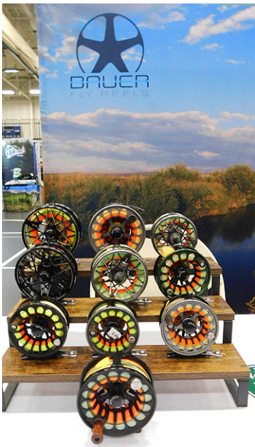
Left: There was a lot of candy for fly anglers at the Expo, including these beautiful Bauer Fly Reels.