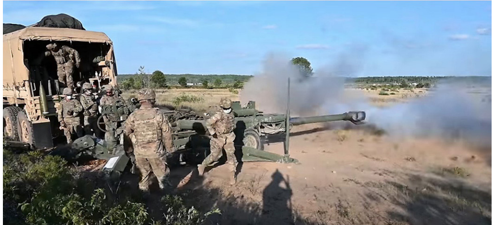
If the Camp Grayling Expansion is approved, 96% of all land in Crawford County will be controlled by the National Guard.

The DNR, by its own mission, is meant to be "committed to the conservation, protection, management, use and enjoy-