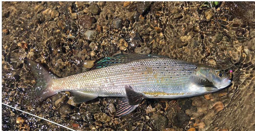
A grayling caught and landed during the MFFC Yellowstone trips this summer.