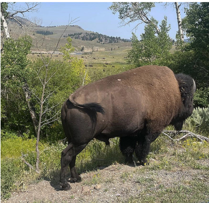
Lesson Learned: Never let the bison see you in Yellowstone National Park. And no selfies with wildlife!